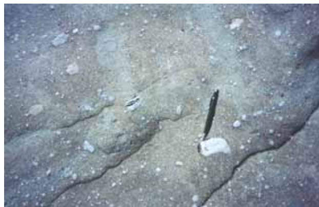
Figure 4 – Detail of the matrix supported conglomerate that represents the most common rock of the Vale da Lua Site.

This facies is the most abundant and is represented by a badly sorted rock, with milimetric the decimetric sub-angular the sub-round fragments, with minor very round or very angular grains (Fig. 4). The rock is matrix-supported, and the matrix is represented by a badly graduated mixture of sand, silte and carbonate. The carbonate occurs in the form of euhedric crystals and as little crystalline mass. The thicker carbonate crystals show purple to reddish tones.