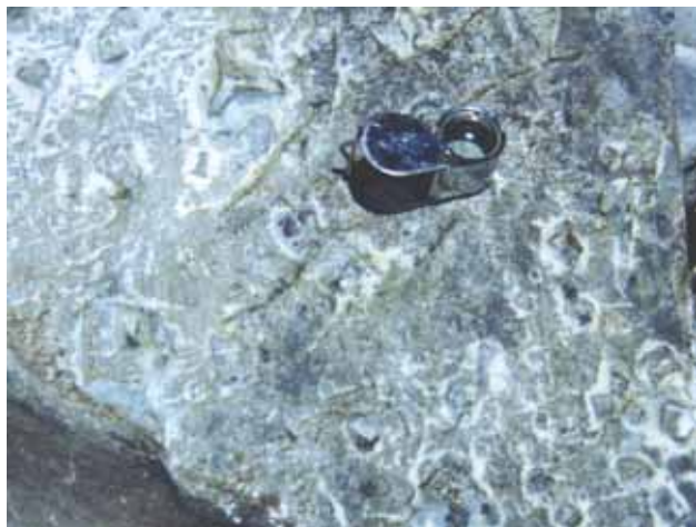
Figure 8 – Pseudomorphs of salt cube formed by aerial exposition of greywacke bed.

Studies developed in thin sections evidence the post depositional transformations impressed in the rocks that are attributed to the diagenesis and metamorphic low grade to which the rock association was submitted during the geological history. The quartzite lithic fragments present sub-grains that indicate high recrystallization degree of original sandstone. The presence of small pelitic clasts, without internal mineral orientation confirms the hypothesis that the lithic fragments had not suffered metamorphism when they were reworked and submitted to erosion and transport.