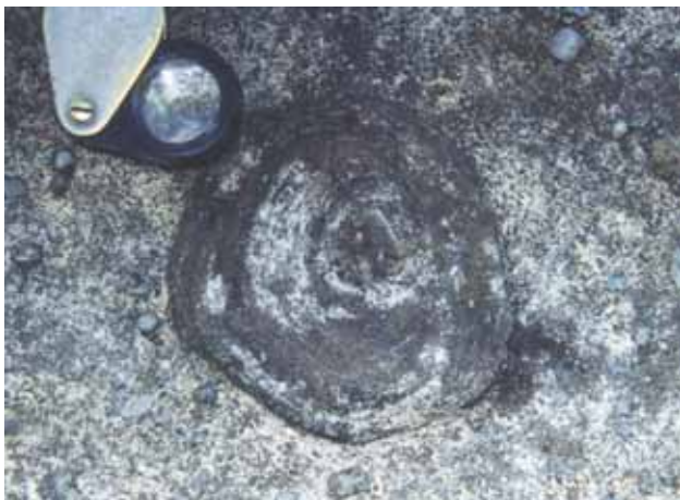
Figure 5A – Carbonate concretion formed by chemical precipitation in the early diagenetic stage. There is iron oxide contribution.

This facies can occur in thin massive layers and in laminated aspect, where it is identified low angle crossed beddings and convolute bedding. The fragments present similar characteristics to those observed in the previous facies. In this case the rock fragments show reduced dimensions of the grains (figure 6).