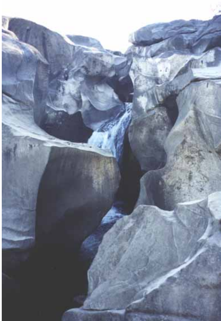
Figure 2 – General aspect of the conglomerate that is continually reworked by fluvial abrasion. On this region the São Miguel stream flows in narrow canyons due to the carbonate dissolution.