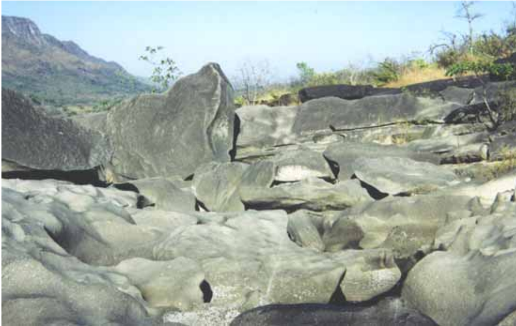
Figure 1 – Erosive features observed in the main section of the Vale da Lua Site. The erosion processes are controlled by the carbonate present as matrix and cement. The “natural sculptures” and the general aspects of the area are the details of more interest by the visitors.