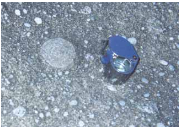
Figure 5B – Carbonate concretion observed as a pseudo clast in matrix-supported conglomerate.

The outcrops related to that facies present rougher surfaces, even when submitted to continuous reworking by river waters.