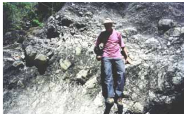
Figure 7 – Intraformational breccia facies with quartzite blocks and boulders associated to de coarse conglomerates facies. Notice the low roundness of the clast.

The fragments vary from some centimeters up to 60 cm and they are angular, very angular and more rarely sub-round (Fig. 7). This facies is massive and just locally it can be observed diffuse bedding or erosive features in the base of diffuse channels.