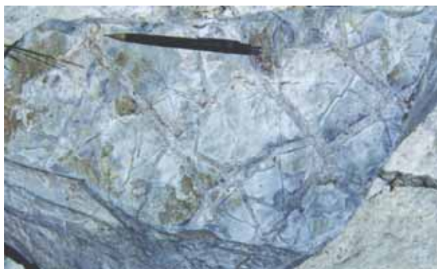
Figure 9 – Dissection cracks preserved in pelitic-laminated level of distal alluvial fans facies.

The observation of the thin sections corroborates the morphologic variation observed in outcrops, and the lithic fragments are sub-angular the sub-round, with predominance of the first type, and with