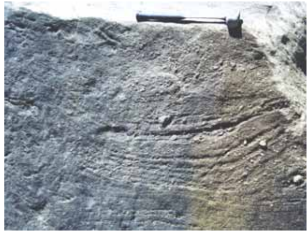
Figure 6 – Fine and laminated conglomerate, showing convolute structure and badly sorted typical of distal alluvial fan facies.

The outcrops related to that facies present rougher surfaces, even when submitted to continuous reworking by river waters.